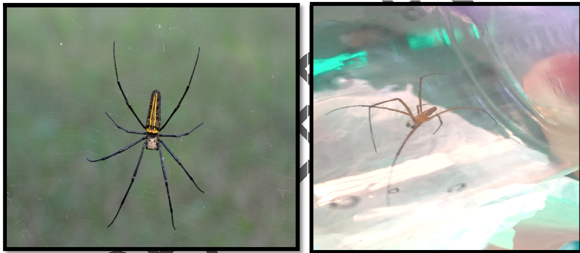
Image 2 :Image of Nephila pilipes from Ratapani Wildlife Sanctuary, Bhopal (M.P.), highlighting the morphological features that illustrate sexual dimorphism between the female and male.

The specimen I collected belongs to the Nephila family. The Nephila family of spiders is commonly found in the area surrounding Ratapani Wildlife Sanctuary. The Nephila spider, also called the Giant Wood Spider or Golden Orb Weaver, belongs to a family known for its large, colorful spiders found in tropical and subtropical areas of Asia and Australia. These spiders are famous for their impressive size, intricate webs, and striking appearance. Despite their imposing size, they pose little threat to humans and are important for managing insect numbers in their environments.