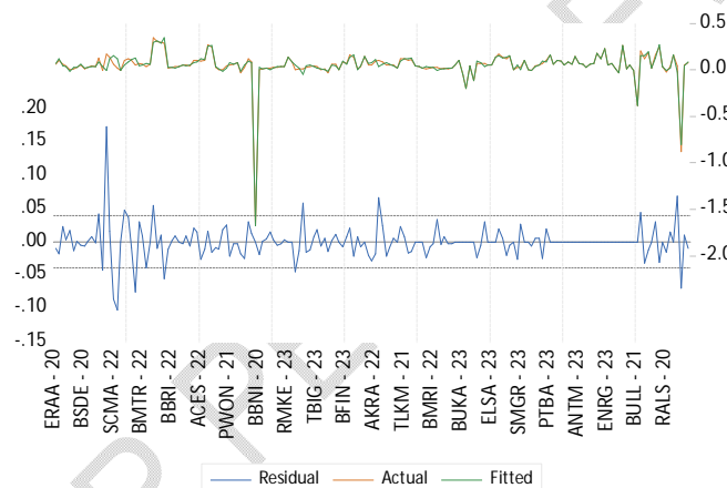
Fig2. Heteroscedasticity Test Result

Note: Return on Asset (ROA), ESG Risk Ratings (ESG), Board Size (BS), Gender Diversity (GD), ESG Risk Ratings interaction variable with Gender Diversity (ES*GD), interaction variable between Board Size and Gender Diversity (BS*GD), Debt to Asset Ratio (DAR), Leverage (LV), Growth of Sales (GR), Firm Size (SZ)