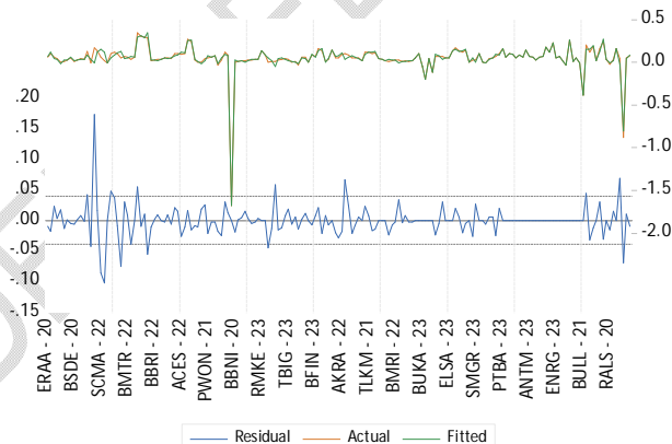
Fig2. Heteroscedasticity Test Result

Note: Return on Asset (ROA), ESG Risk Ratings (ESG), Board Size (BS), Gender Diversity (GD), ESG Risk Ratings interaction variable with Gender Diversity (ES*GD), interaction variable between Board Size and Gender Diversity (BS*GD), Debt to Asset Ratio (DAR), Leverage (LV), Growth of Sales (GR), Firm Size (SZ)