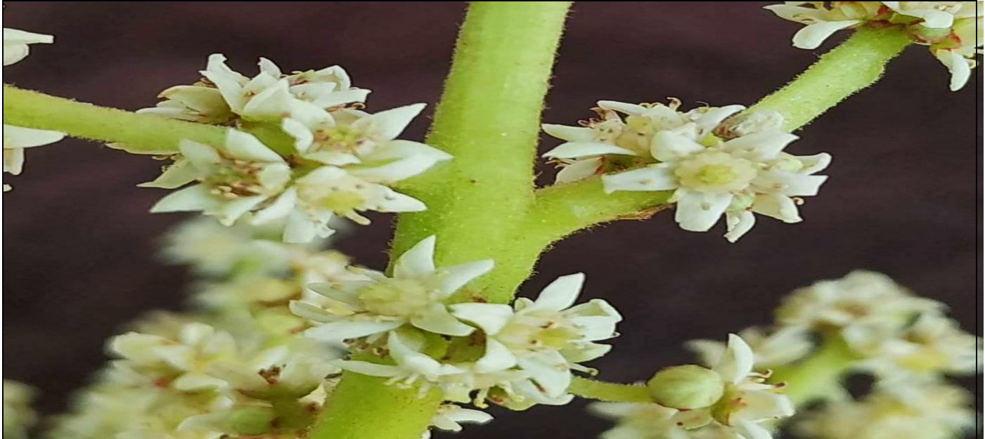
B. Creamy white sepals