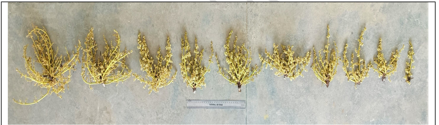
Fig.2: VARIATION IN INFLORESCENCE