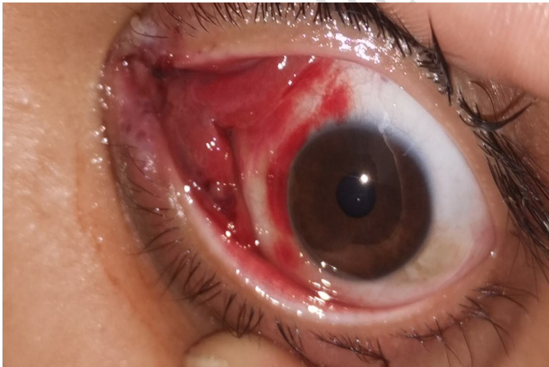
Figure 1 : A bright pink-red lesion in the medial canthus

lesion appeared heterogeneous on the MRI, with isosignal T1 and hypersignal T2. It showed moderate contrast enhancement and measured 44 mm anteroposteriorly, 30 mm in width, and 36 mm in height. The lesion infiltrated the intra- and extraconal fat and involved the optic nerve, although the nerve remained well individualized. The lesion predominantly affected the internal angle of the orbit, resulting in grade III exophthalmos (figure 2). The patient was referred to the neurosurgical department for management. She underwent complete en bloc excision of the left intraorbital lesion using a high endocranial approach. The lesion was encapsulated and had a hard consistency. Histological examination of the excised specimen confirmed the diagnosis of intra-orbital cavernous hemangioma. The immediate post-operative course was uneventful, with complete regression of the left exophthalmos. Palpebral ecchymosis and left chemosis appeared after the surgery but resolved completely within a few days. After a two-year follow-up, the patient showed no signs of local recurrence.