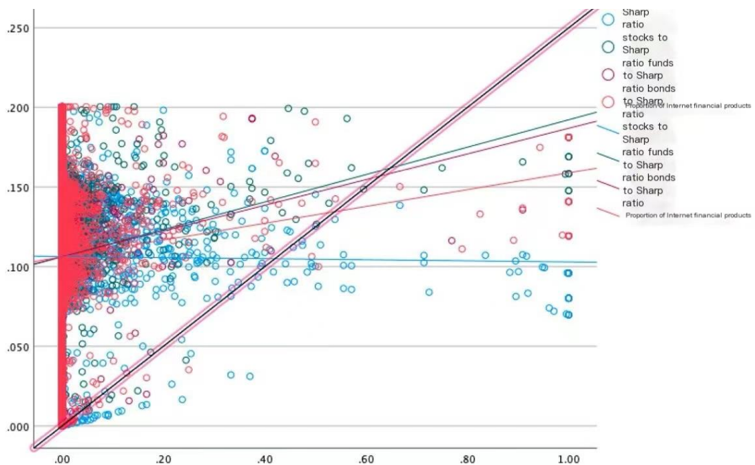
Figure 3 Scatterplot of correlation between Sharpe ratio and share of stocks,

As the main indicator of family asset allocation is the Sharpe ratio, the author, to explore the correlation between family pension insurance and the Sharpe ratio, carried out a correlation analysis, and obtained Table 2. According to the analysis of the table, the correlation coefficient is 0.118, p < 0.05 , presenting a significant and weak correlation between the Sharpe ratio and pension insurance, and showing a positive correlation. As the first pillar of China's pension, the basic family pension insurance occupies a dominant position, and the social security system is complete. What about in the field of other financial assets investment?