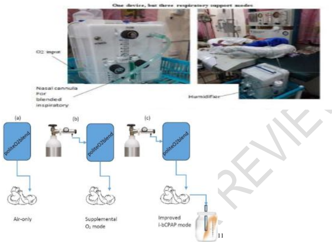
Fig 1 : Instrumental device and study protocol

The invention aligns with the position of PATH (2015), where the organisation notes that there is a clear need for these low-cost oxygen-air mixer devices as respiratory infections are a leading cause of infant mortality in many of the world's poorest places and claim millions of newborn lives each year. A bubble CPAP device can provide an infant with the air pressure needed to support their breathing, and when combined with an oxygen blender, it can deliver critically needed oxygen at appropriate concentrations. These interventions can mean the difference between life and death and between healthy infant development and lifelong neurological damage or blindness. While bubble CPAP devices and oxygen blenders are standard in American neonatal wards, their high cost puts them beyond the reach of many hospitals, as does their requirement for pressurised oxygen and air, steady power, and access to trained technicians and replacement parts.