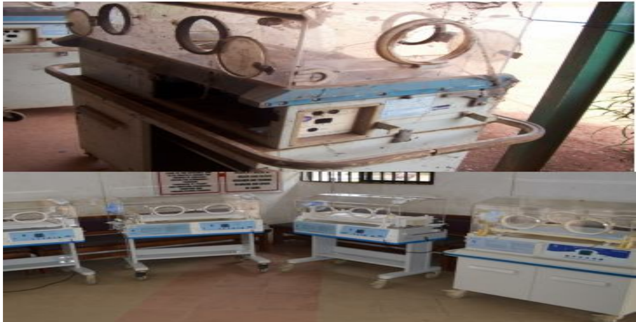
fig 3 :RIT: New low-cost systems, capable of 10 years of life, easily maintained by locals, applied in over 20 Nigerian referral hospitals 13

The Recycled Incubator Technique (RIT) refers to an innovative approach involving the use of repurposed or reused materials to create an incubator for neonates, demonstrating a sustainable and cost-effective solution for providing controlled environments to support the health and development of newborns, particularly in resource-constrained settings.