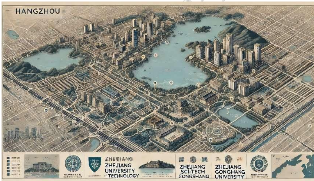
Fig. 2 Map of Universities in Zhejiang Province

The following map illustrates the locations of these universities within Hangzhou, highlighting key economic and cultural landmarks that influence student life and consumption behaviors.