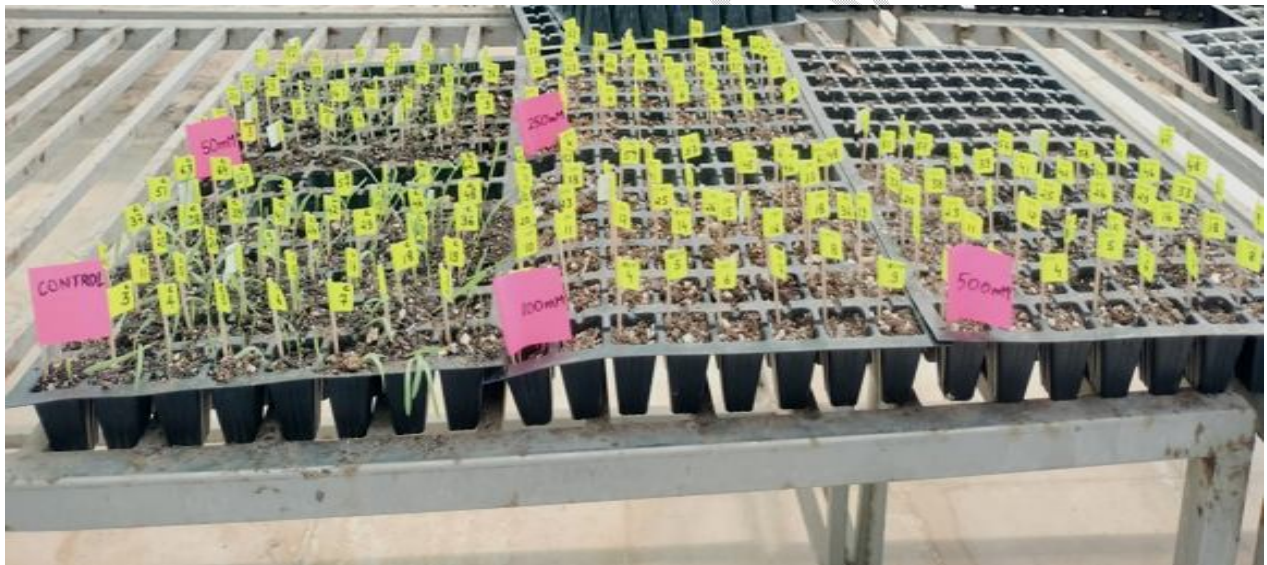
FIG.2. Screening of kodo millet genotypes for salt stress in germination tray