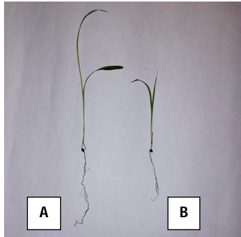
FIG.1. Difference between shoot length, root length and seedling length of seedling under [A] control (0 mM) and [B] salt stress (50 mM)