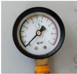
Fig 6. pressure gauge

The lateral pipe was selected according to discharge and capacity to withstand the pressure. The lateral pipe of 16 mm, made of Linear low-density polyethylene (LLDPE) material was selected to deliver the water to the foggers from storage tank.