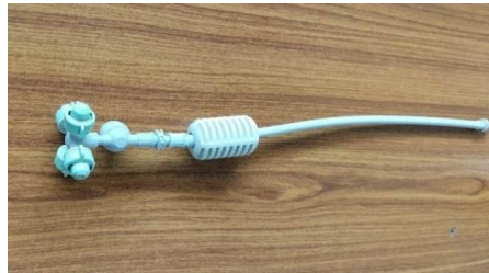
Fig 5. fogger

system. The rated operating pressure of the selected four-way fogger was 4 to 5 kg cm -2 . The maximum discharge of the selected fogger was 12 l h -1 when the fogger was operated at rated pressure. The specification of fogger is presented in Table 5.