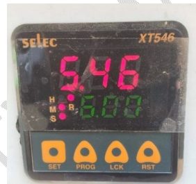
Fig 4. Digital Timer