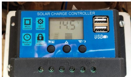
Fig 3. Charge controller

The digital timer device was used to operate the fogging system at a certain time interval, as per the requirement i.e. cyclic time interval (on/off). A 48 x 48 mm digital timer with 3 digits, 7 segment LED, dual display was mounted between battery and pump. It has different modes of operation (fig 4). They are ON delay, Interval, Cyclic ON first and Cyclic OFF first. The specifications of timer switch are listed in Table 4.