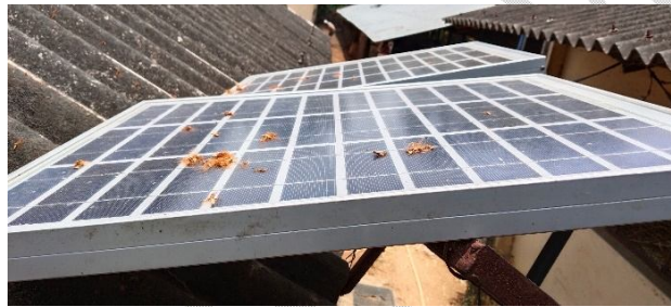
Fig 1. Solar panel

The solar panels were selected based on the power requirement of the motor and the pump. The main parameter which influences the solar panel is the temperature of the region and maximum sunshine hours. Based on power requirement by the pump, two solar panels of capacity 37 W each were selected (fig 1). The specification of single panel module is presented in Table 1.