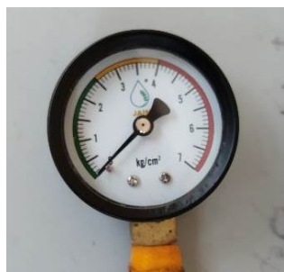
Fig 6. pressure gauge

The lateral pipe was selected according to discharge and capacity to withstand the pressure. The lateral pipe of 16 mm, made of Linear low-density polyethylene (LLDPE) material was selected to deliver the water to the foggers from storage tank.