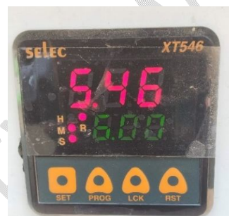
Fig 4. Digital Timer