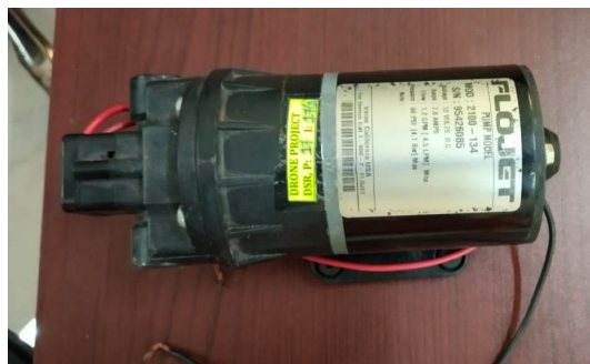
Fig 2) DC pump

The selection of dc pump involves the discharge rate and the operating pressure required for the cooling system. The actual power required to pump the water and power available from the solar panel modules should be matched. Thus the dc motor coupled with pump was selected based on the power requirement for the operating the cooling system and the power calculation has been explained in the section 1. The specification of the selected pump is presented in Table 2.