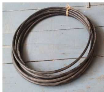
Fig 7. lateral pipe