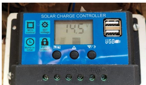
Fig 3. Charge controller

The digital timer device was used to operate the fogging system at a certain time interval, as per the requirement i.e. cyclic time interval (on/off). A 48 x 48 mm digital timer with 3 digits, 7 segment LED, dual display was mounted between battery and pump. It has different modes of operation (fig 4). They are ON delay, Interval, Cyclic ON first and Cyclic OFF first. The specifications of timer switch are listed in Table 4.