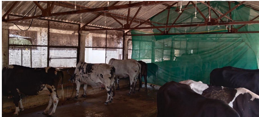
Fig 8. Solar power-assisted cooling system in an animal housing structure