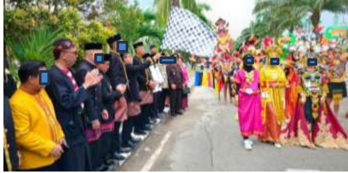
Image 2: Festival of Adat Nusantara Celebration in East Kutai Regency

This reflects the importance of traditional rituals and cultural festivals in the context of preserving and promoting local culture, as well as the positive economic and social impacts of tourist participation in these cultural activities. Thus, the implementation of this strategy by the Tana Toraja community can be considered a best-practice model in local cultural empowerment efforts that is relevant for dissemination in a broader context.