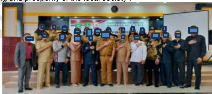
Image3: The government inaugurated the administrators of Interfaith Youth (PELITA), Interfaith Women (PERLITA) and Village Harmony Awareness (DSK) for the period 2023-2028.

The collaboration between the Tana Toraja community, local governments, and non-governmental organizations (NGOs) plays a crucial role in sustaining cultural programs, as highlighted in various research papers. External support in the form of financial and logistical assistance enables communities to implement empowerment programs more effectively and on a broader scale, ensuring their sustainability [29] [30]. This collaboration signifies a shared dedication to preserving and promoting local culture as a valuable resource for social and economic development, emphasizing the importance of gaining outside support to ensure the continuity of cultural initiatives [31] [32]. By working together with external partners, the Tana Toraja community showcases the significance of external backing in maintaining the richness and vitality of cultural programs, ultimately contributing to the overall well-being and prosperity of the local society .