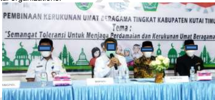
Image 6 :District Level Religious Harmony Development with the Theme: The Spirit of Tolerance to Maintain Peace and Religious Harmony

Community empowerment plays a crucial role in preserving multicultural values by fostering higher levels of participation in cultural and social activities within empowered communities [46]. Studies by Chavis and Wandersman further support this notion, indicating that community empowerment can instill a sense of ownership and responsibility towards the preservation of local culture [12]. In the specific context of Tana Toraja in East Kutai, community empowerment is anticipated to not only strengthen cultural identity but also enhance social cohesion, as highlighted by Pakkanna et al. (2018). By empowering communities, individuals are more likely to engage in activities that promote and safeguard their cultural heritage, ultimately contributing to the preservation of multicultural values and fostering a sense of collective responsibility towards cultural conservation. The results of this study reveal that empowerment of the Tana Toraja community in East Kutai has a significant role in maintaining their multicultural values. The empowerment strategies undertaken have helped to strengthen cultural identity and improve social cohesion within the community. However, the challenges faced, such as limited resources and external social changes, indicate the need for greater support from various parties, including the government and non-governmental organizations.