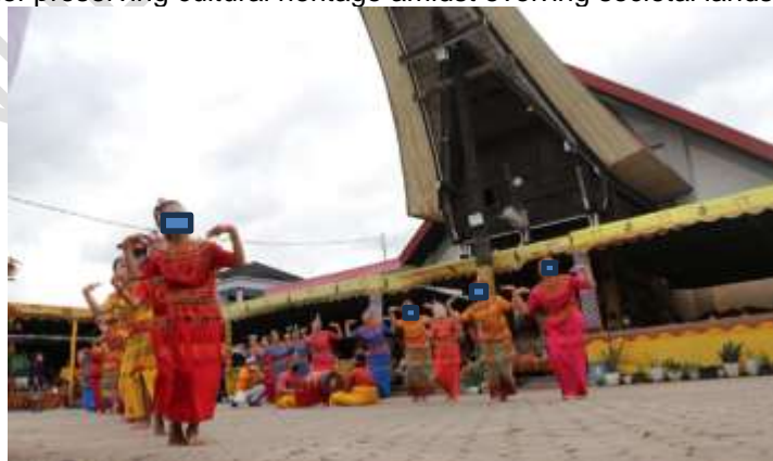
Image 5: Mutlicultural Value Empowerment through traditional celebrations in Tana Toraja Village, East Kutai Regency

The internal challenges within a community, such as differences in views on tradition and the younger generation's lack of interest in cultural heritage, underscore the intricate dynamics present. Analyzing social, economic, and cultural factors underlying these differences can offer a deeper insight into local community dynamics. External challenges like the impact of modernization and urbanization pose a threat to the sustainability of cultural values. Understanding how these external factors influence the social and cultural fabric of communities and implementing strategies to mitigate their adverse effects [41] can provide a nuanced perspective on social change dynamics at the local level, emphasizing the importance of preserving cultural heritage amidst evolving societal landscapes.