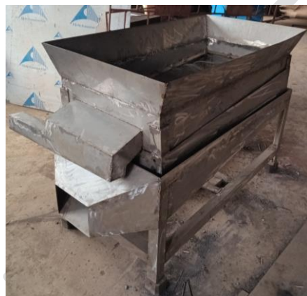
Fig. 4: Fabricated Double-Layered Grain Sieving Machine

When the concrete vibrator is electrically powered on, it produces high-frequency vibration (linear and rotational) which is also transferred to the whole machine thereby causing the grain in the upper layer of the sieving machine to be engaged for sieving before going through the bottom layer for another process of sieving. This double-layered grain sieving machine ensures more efficiency and finer grain at the collection point.