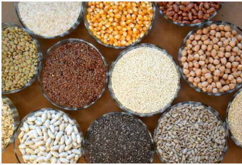
Fig. 1: Different types of Grains

Economically, sieving contributes to increased efficiency in milling and processing operations by ensuring that only grains of the desired size proceed to the next stages, thus reducing waste and optimizing resource use. Overall, the practice of sieving grains is indispensable in maintaining high standards in the grain supply chain, promoting better health outcomes, and supporting sustainable agricultural practices [5].