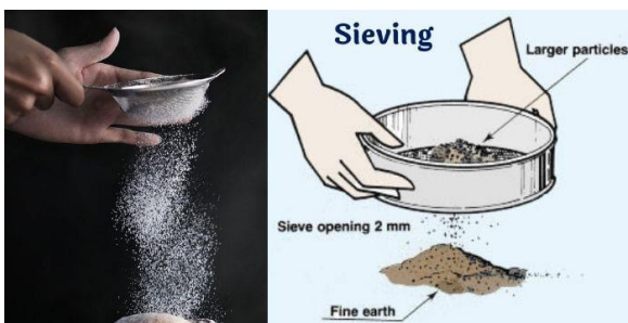
Fig. 2: Hand Sieving

Hand sieving is a particle size analysis method that has been practiced for nearly as long as humans. From ancient farmers using simple screens to separate grains and seeds to the original gold miners discovering their nuggets, sieving has always been an easy way to separate particles of different sizes.