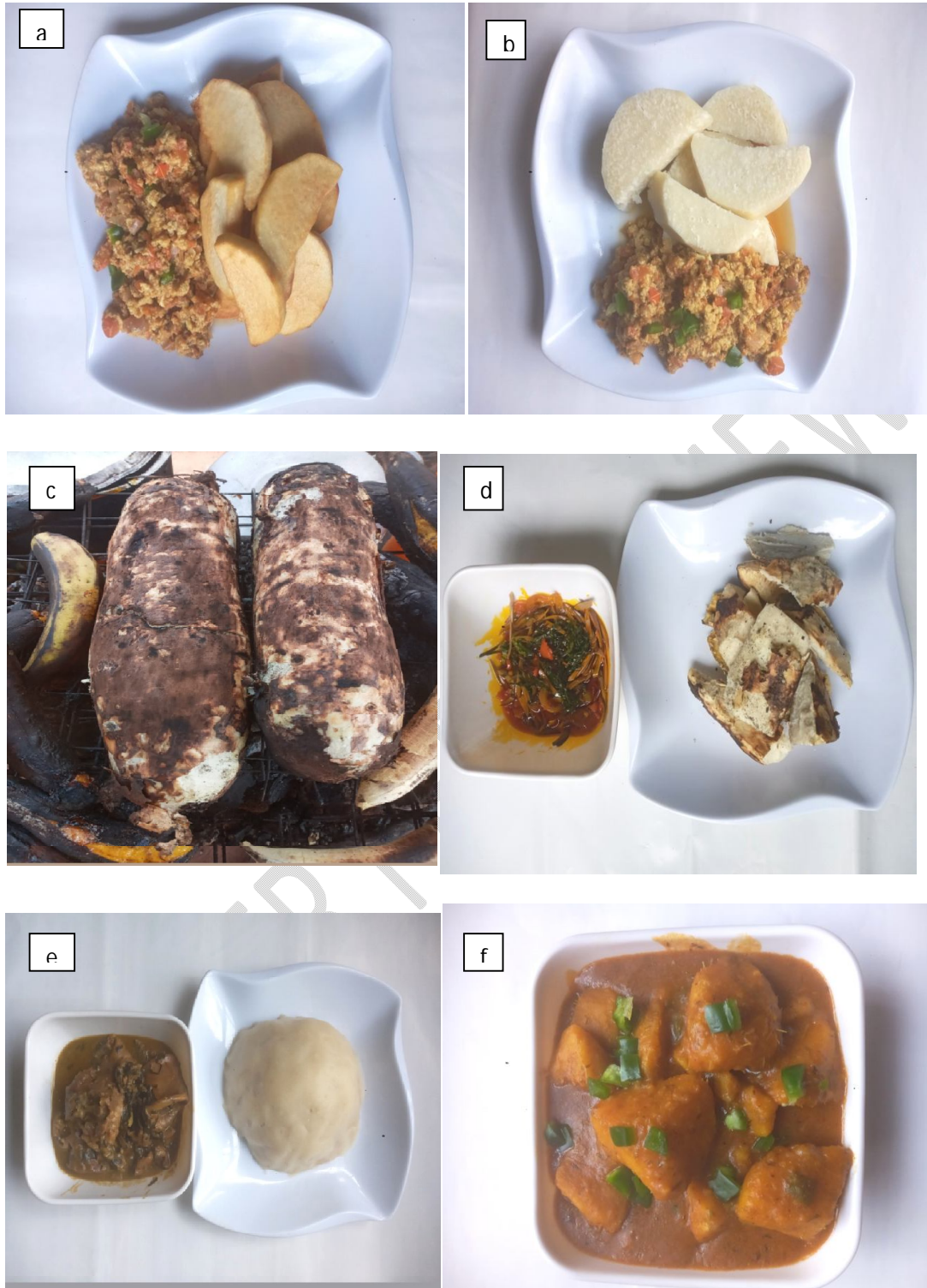
Plate 1: Diverse Food Forms and Preparations from Yams Consumed by Respondents

(a) Fries/Chips (b) Cooked/Boiled (c) Roasted yam (d) Roasted yam paired with palm oil sauce (e) Pounded yam paired with "ofensala" (f) Porridge