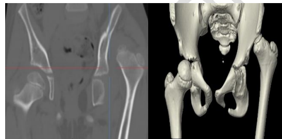
Fig. 2. Developmental dysplasia of hip

On CT imaging, Superior-posterior migration of head of femur noted with head noted in upper outer quadrant on left side. Discontinuity of Shenton's line noted on left side. Head of femur noted above hilgenreiner line. Epiphysis of head of femur on left side appear smaller in size. Shallow acetabulum noted on left side with fibrofatty tissue noted in acetabular fossa. (Fig. 2)