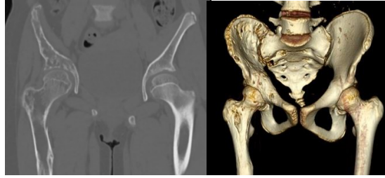
Fig. 1. Fibrous dysplasia