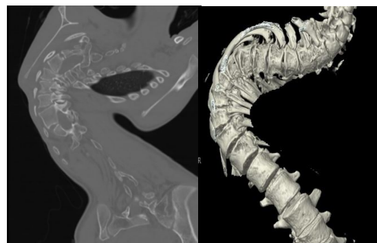
Fig. 3. Severe kyphoscoliosis

On CT imaging, Severe kyphoscoliotic deformity of dorso-lumbar spine with convexity towards right side noted in lower thoracic and upper lumbar spine with crowding of ribs noted. cobb's angle measures more than 40 degree (severe kyphosis). (Fig. 3)