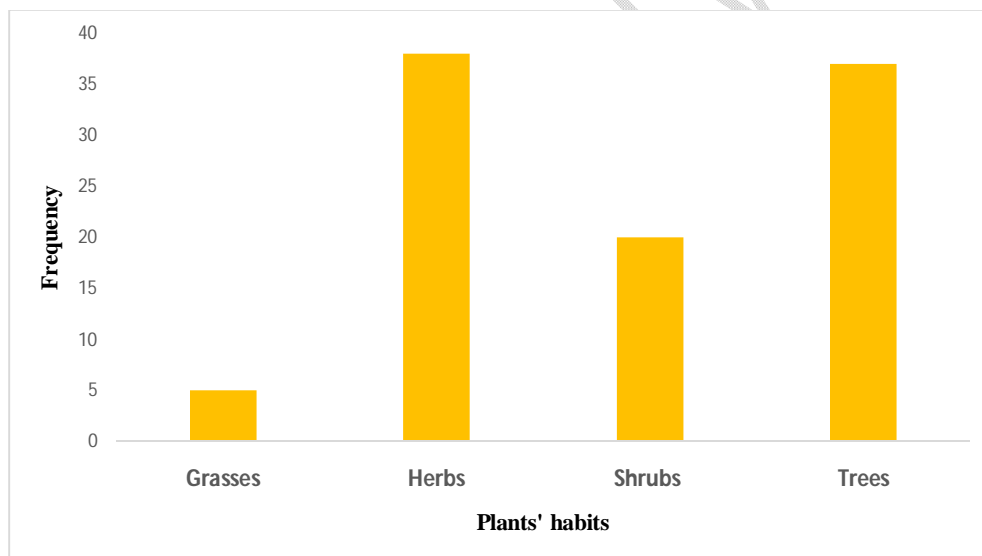
Fig 2: Plants' habit distribution pattern

Figure 4 also showed the list of plant species that were identified to be of high medicinal value to treat different categories of health related issues (later grouped into 21 in table 3) and analyzed using Factor Informant Consensus and Fidelity Ratio as used by [ 2 ]. The numbers of species used to treat different ailments were revealed in figure 4.