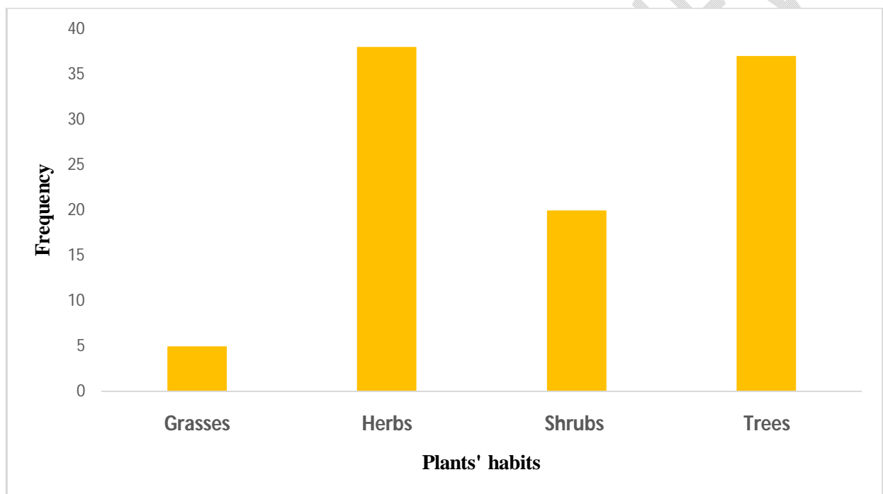
Fig 2: Plants' habit distribution pattern

Figure 4 also showed the list of plant species that were identified to be of high medicinal value to treat different categories of health related issues (later grouped into 21 in table 3) and analysed using Factor Informant Consensus and Fidelity Ratio as used by [ 2 ]. The number of species used to treat different ailments were revealed in figure 4.