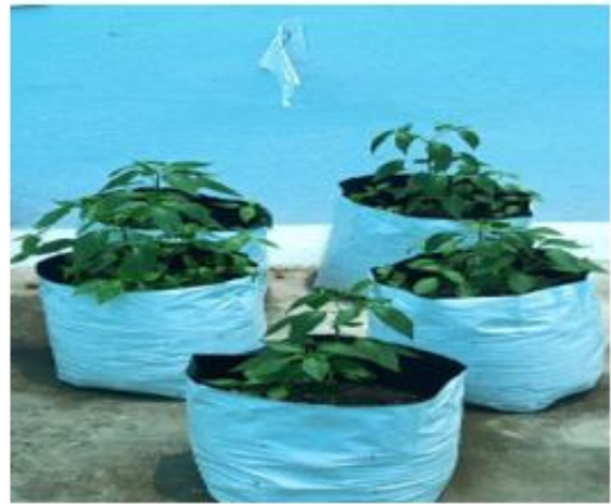
GROUP D (30C)