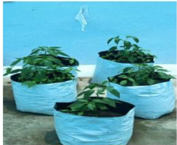
GROUP D (30C)