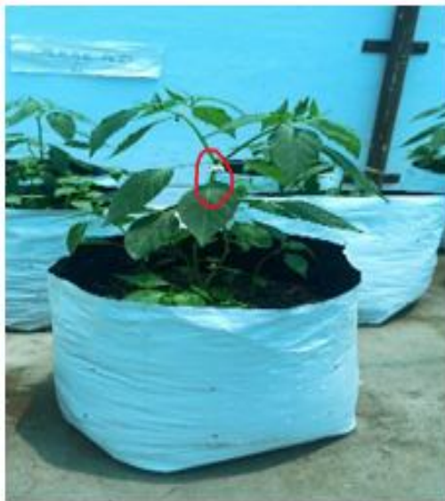
GROUP C (12C)