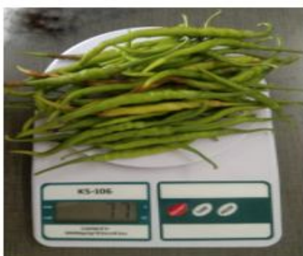
GROUP C (12C)