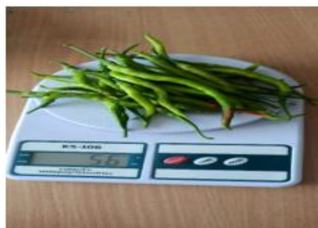
GROUP B (6C)