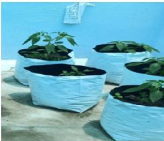
GROUP C (12C)