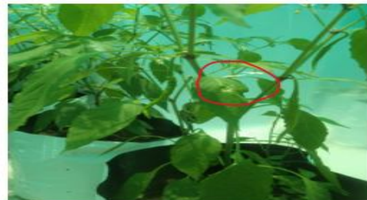
GROUP D (30C)