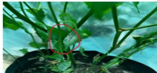
GROUP B (6C)