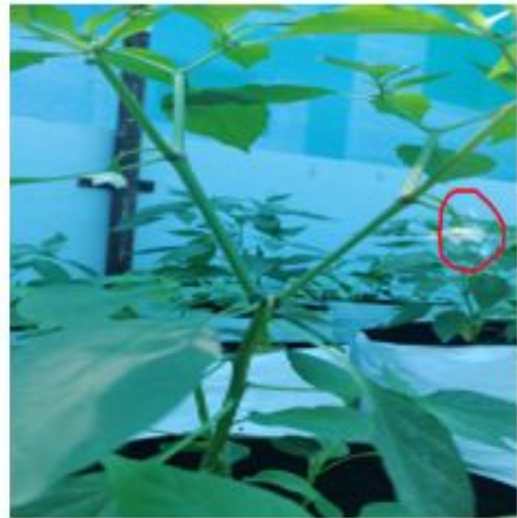
GROUP B (6C)