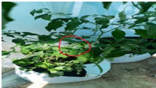
GROUP C (12C)