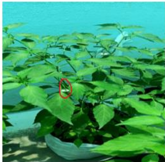
GROUP D (30C)