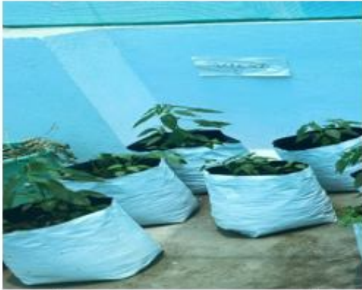
GROUP A (PLACEBO)