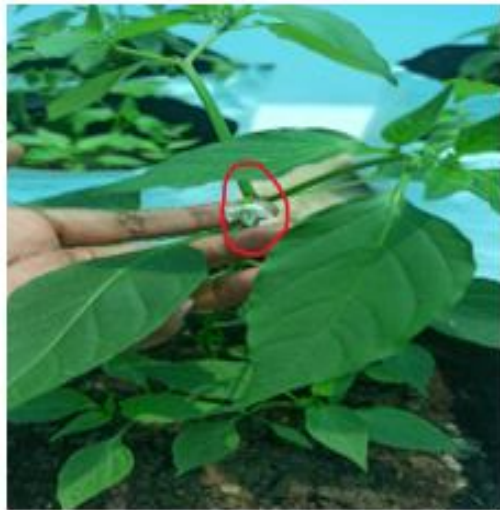
GROUP A (PLACEBO)