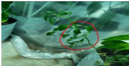
GROUP A (PLACEBO)