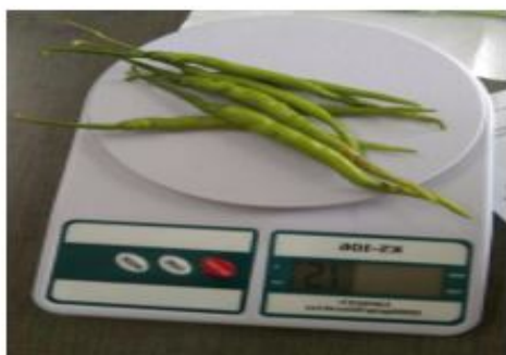
GROUP A (PLACEBO)