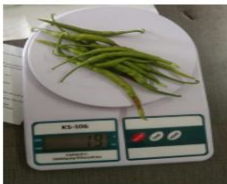
GROUP D (30C)