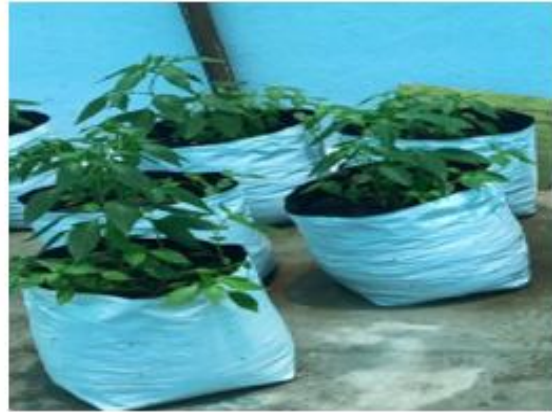
GROUP B (6C)