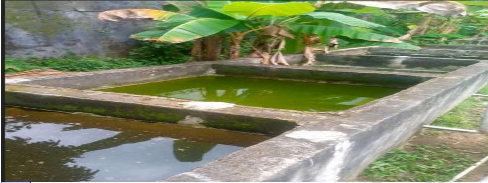
Plate 1: Experimental setup

Comment [U7]: Check the term is it plate or figure ?