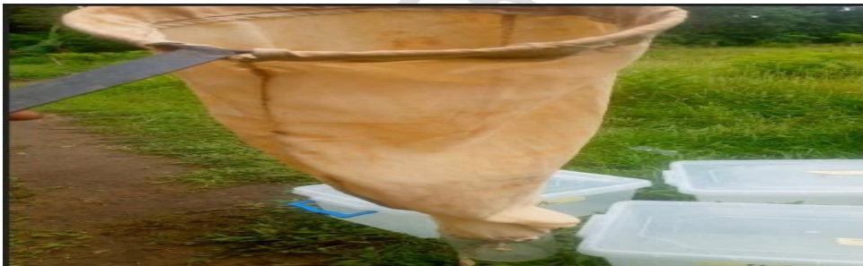
Plate 2: Plankton net