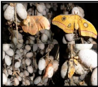
Figure 1: Tasar silk cocoon

India has the distinction of being the world's second-largest producer of raw silk, with an annual output of 34,903 MT in 2021-22. Notably, India produces all four varieties of silk,