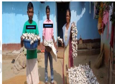
Figure 2: Tasar cocoon rearing