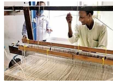
Figure 3: Tasar silksaree production

including Mulberry, Tasar, Muga, and Eri. Vanya Silk production, which includes Tasar silk, contributed about 9,085 MT during 2021-22, accounting for around 26% of the total silk production in India. Among the Vanya silks, Eri silk, with a production of 7,364