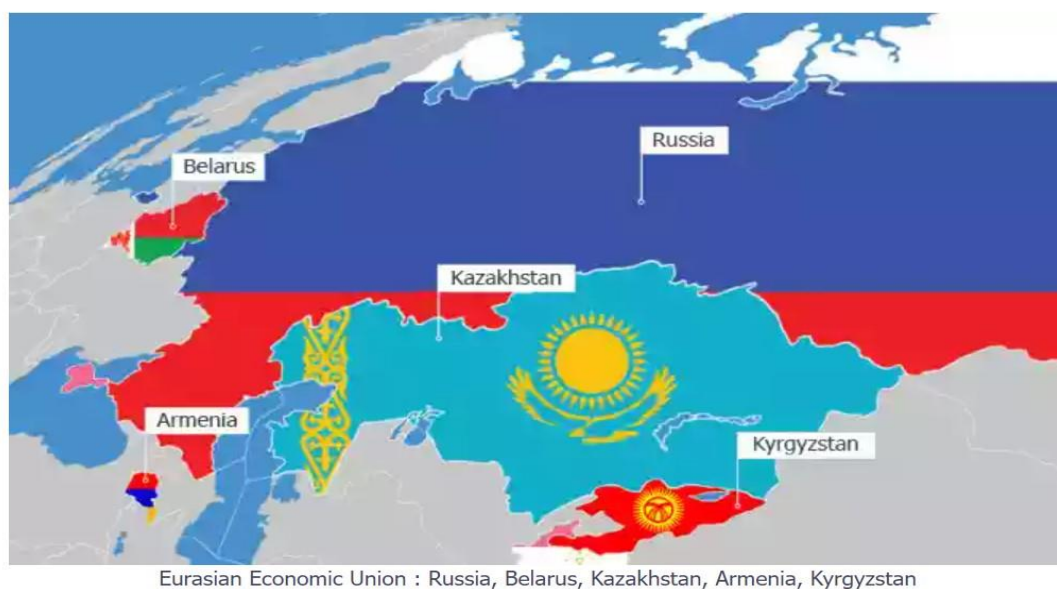
Figure 1: Map of Eurasian Economic Union

This study employs a qualitative approach, relying on existing data from a comprehensive literature review to examine the Eurasian Economic Union's development and impact. Sources include scholarly articles, official documents, and reports from organizations such as the Asian Development Bank, Eurasian Economic Commission, and various academic researchers. By synthesizing these diverse sources, the study aims to provide an in-depth analysis of the EAEU's institutional framework, historical development, and economic integration outcomes. Figure 1 below shows the Eurasian Economic Union members emphasizing on what they stand for.