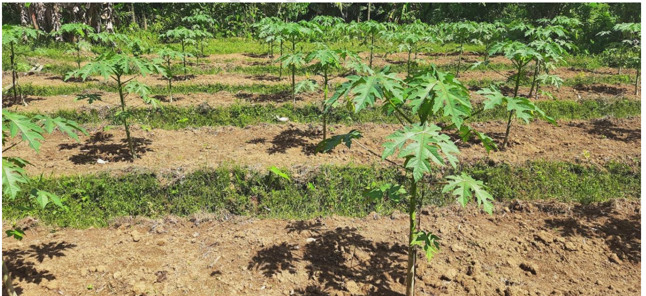
Picture1. INM plot of papaya