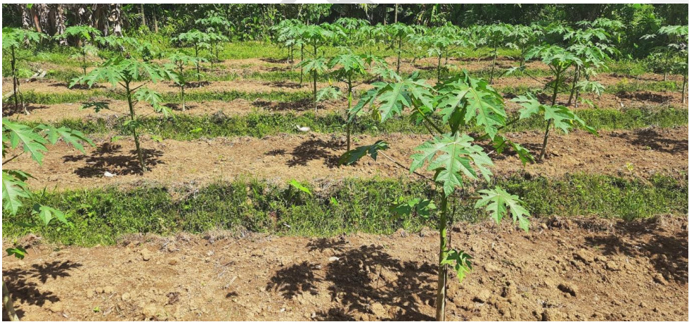
Picture1. INM plot of papaya