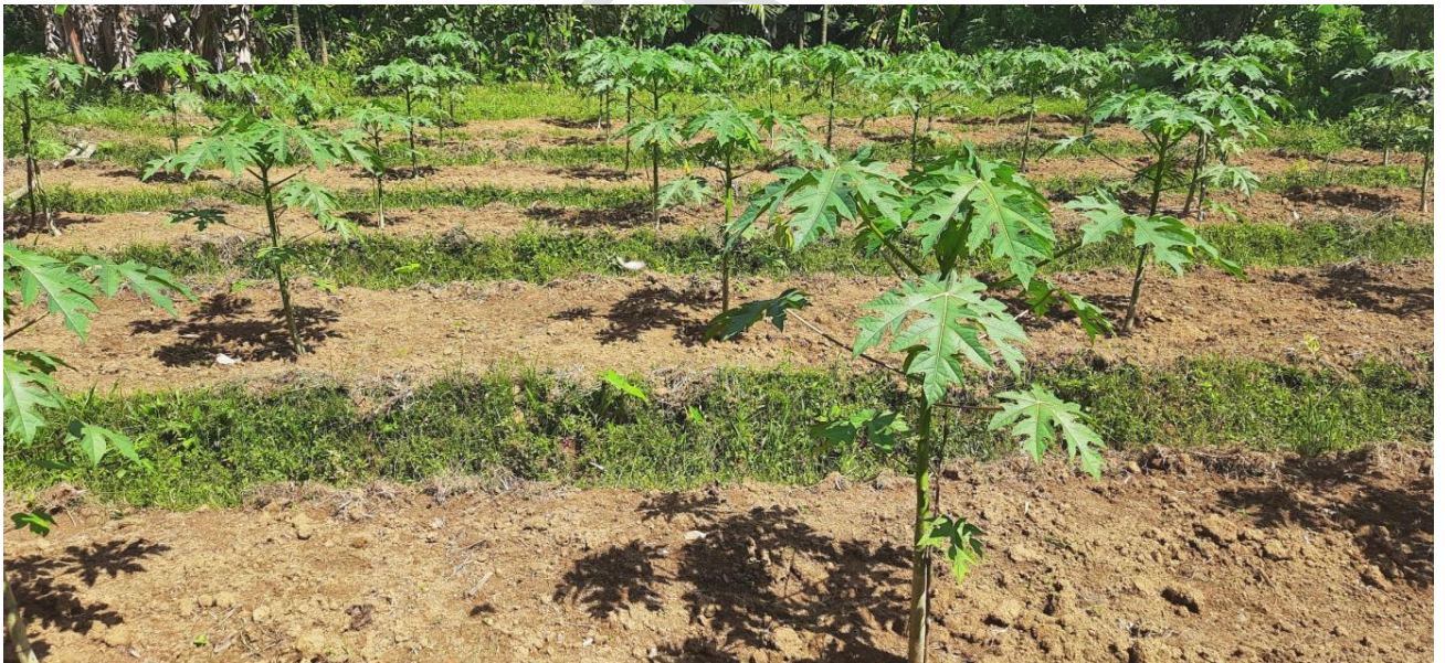
Picture1. INM plot of papaya