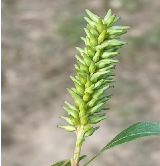
Fig 2. Female catkin of Salix