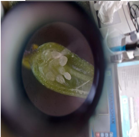
Fig 3. Ovules of Salix alba