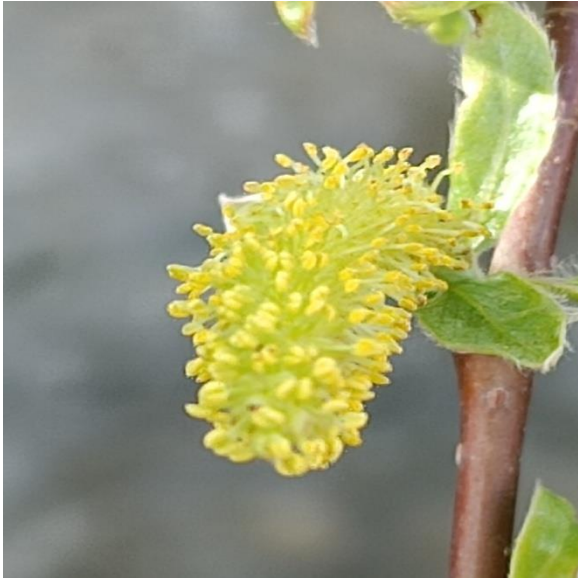
Fig 1. Male catkin of Salix alba