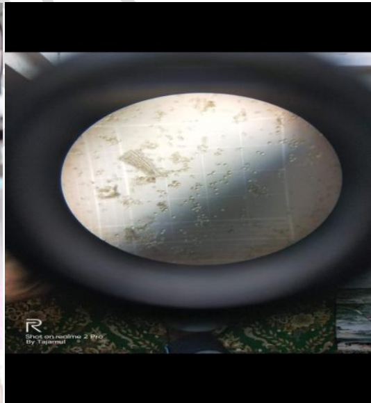
Fig 4. Pollens of Salix alba