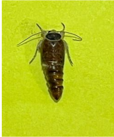
Fig:5 Larval- pupal intermediates due to NPV infection