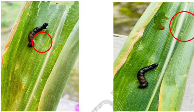
Fig:2 orange brown liquid discharge from body of larvae