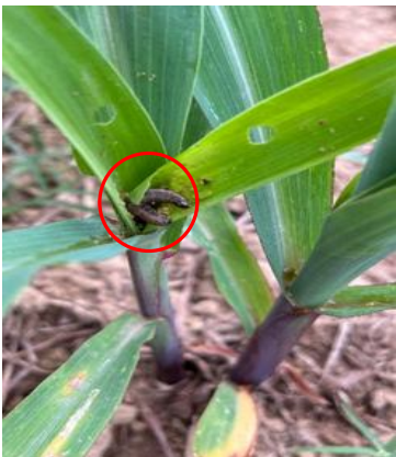
Fig:3 NPV infected larvae before death