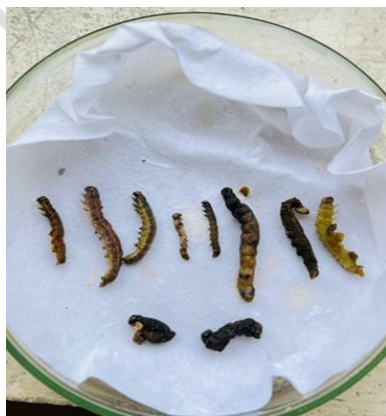
Fig:4 Dead larvae from laboratory