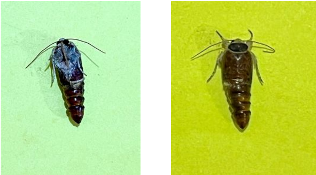
Fig:5 Larval- pupal intermediates due to NPV infection