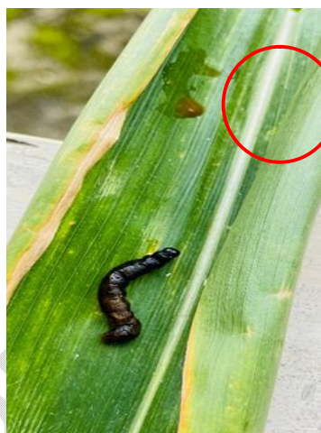
Fig:2 orange brown liquid discharge from body of larvae