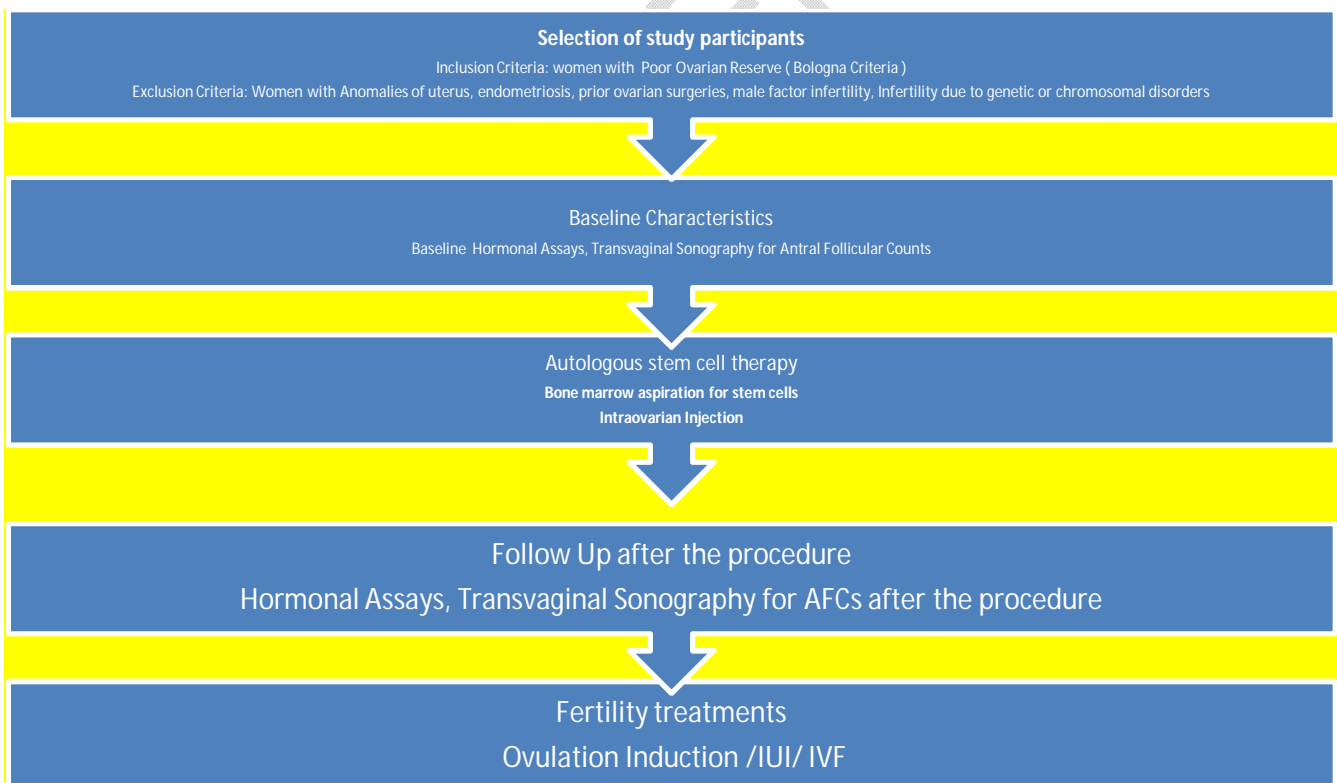
Figure 1: Methodology

This was a prospective observational study conducted in the fertility clinic for 1 year from June 2022 to June 2023 at Srikari Hospital, Hospet among the women diagnosed with Poor Ovarian reserve with Infertility. The Bologna Criteria was used for diagnosing the cases of Poor ovarian reserve. Women with Anomalies of the uterus, endometriosis, prior ovarian surgeries, male factor infertility, and Infertility due to genetic or chromosomal disorders were excluded from the study. The Participants were included using purposive sampling.