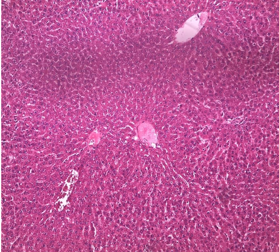
Fig 1: Histological section of liver of control rat

p=0.835), total bilirubin ( r=0.19 , p=0.708 ), conjugated bilirubin ( r=0.51 , p=0.306 ), total protein ( r=-0.54 , p=0.268 ) and albumin ( r=-0.38 , p=0.460 ) in male diabetic albino rats (See table 9).