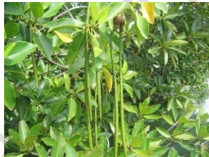
Plate 1. Rhizophora sp.

The lowest survival was with Sitio Tawang with 70.46 because the area is prone to flooding according to the interview conducted to the local settlers (Figure 1). The area is also adjacent to the river that during heavy rains, flash flood can affect the newly planted mangroves. Jimenez and Lugo (1985) mentioned that severe environmental disturbances can inflict larger-scale mortality on mangrove forests. These disturbances include periodic flash floods, monsoon and other storms, which bring heavy sedimentation. Pacyao and Llameg (2018) also supported this finding that when the mangrove area is located in a seaward zone, a 13.71% survival rate is expected to happen due to direct exposure to winds and waves.