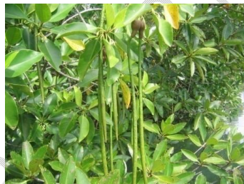
Plate 1. Rhizophora sp.

The lowest survival was with SitioTawang with 70.46 because the area is prone to flooding according to the interview conducted to the local settlers (Figure 1). The area is also adjacent to the river that during heavy rains, flash flood can affect the newly planted mangroves. Jimenez and Lugo (1985) mentioned that severe environmental disturbances can inflict larger-scale mortality on mangrove forests. These disturbances include periodic flash floods, monsoon and other storms, which bring heavy sedimentation. Pacyao and Llameg (2018) also supported this finding that when the mangrove area is located in a seaward zone, a 13.71% survival rate is expected to happen due to direct exposure to winds and waves.