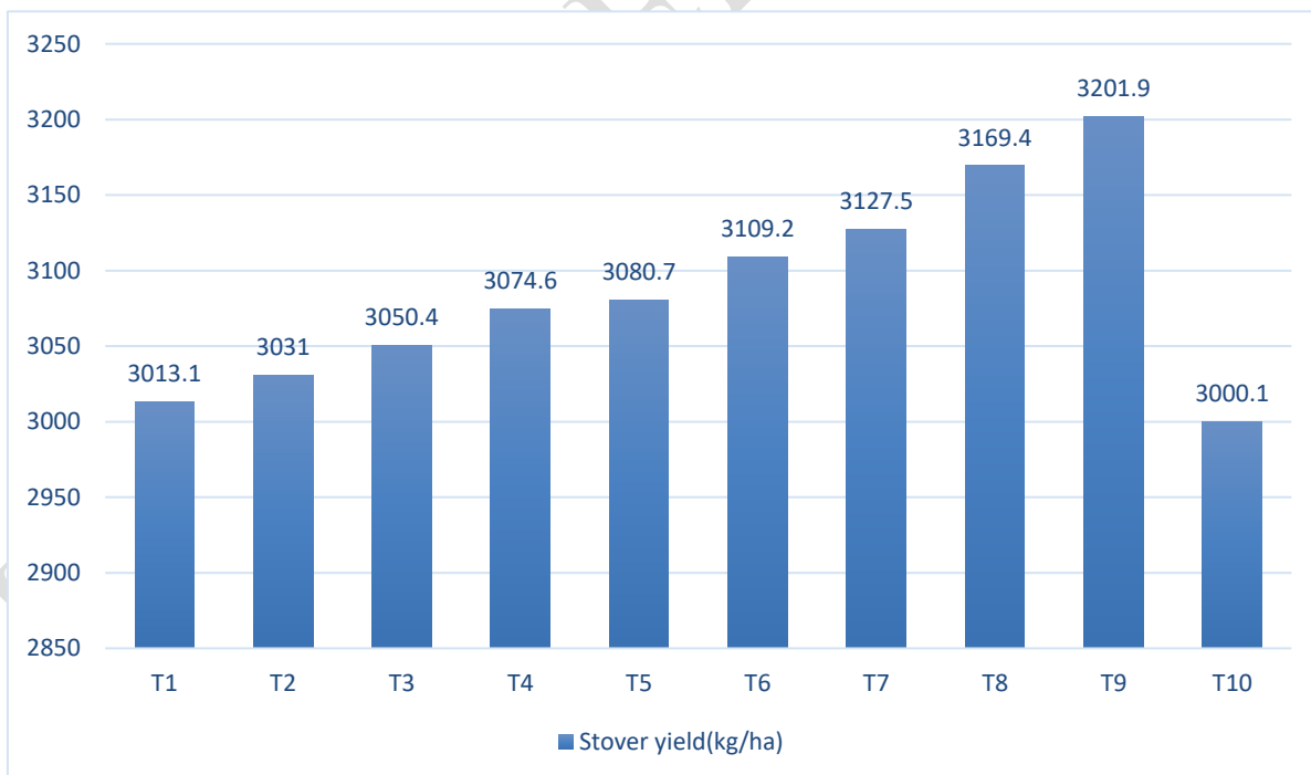
Fig 2 : Graphical representation of Stover yield kg/ha as influenced by Application of Sulphur 35 kg/ha along with Zinc 15 kg/ha