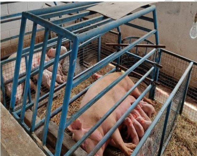
Figure 1: Conventional farrowing Crate

The study was conducted in Piggery Unit of Livestock Farm Complex, Tamil Nadu Veterinary and Animal Sciences University, Madhavaram, Chennai for a duration of twelve months. Eighteen number of Large White Yorkshire sows of different parities were selected for this study. Breedable females were housed in conventional sty in groups of four after mating. During the observation period, five days before the expected farrowing date, each sow were moved randomly from the conventional sty to the farrowing unit in one of the three farrowing facilities/crate models on the basis of farrowing stage. Thus, out of the eighteen breedable females, six females were placed in Conventional farrowing crate (Figure 1), six sows were placed in Guard rail model farrowing facility (Figure 2) and six sows were placed in a modified farrowing facility (Figure 3). The modified farrowing facility was specially designed with elevated slatted floor, hinged sides, nest box for the piglets and swivelling rods to allow short-term restraining which slows down the movement of sows. Weaning of piglets were done at 42 days of age. Subsequent to weaning, the piglets were placed in the weaner shed. Piglets that were less than 6 Kg were retained for another week.