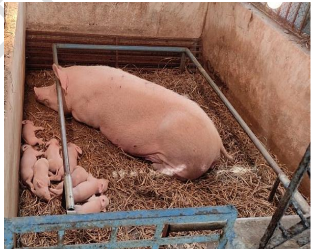
Figure 2: Guard Rail Model