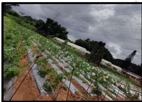
Plate-Figure1: General view of the experiment plot