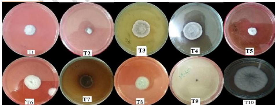
Fig 1. In vitro evaluation of botanicals and fungicide against Alternariasolani You must explain the Fig.

Methods: In-vitro assessment of plant extracts and fungicide against Alternariasolani was done by poisoned food technique. The treatments evaluated after seven days of colony growth by taking average mycelial growth and inhibition percentage. In present study, all the All of the tested tested extracts at 10% concentration were significantly ( P \leq 0.01 ) reduced linear growth and increased inhibition percentage compared to control. Among the tested plant extracts, garlic clove extract was found expressively most efficacious and indicated maximum percentage inhibition that was 90.54% at 10% concentration followed by Neem leaf extract (87.83%), Ginger (83.78%), Eucalyptus (75.67%), Bael (71.67%), Onion bulb extract (68.67%) and Ashwagandha (63.51%) respectively. While, Lantana (52.70%), was the least effective extract with 35 mm mycelial growth. Mancozeb was most effective fungicide against early blight of tomato percentage inhibition was 93.24% at 0.25% conc. gave the best control over mycelial development.