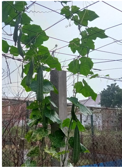
b) Fruiting in growing media with CP+VC+FA+Sand