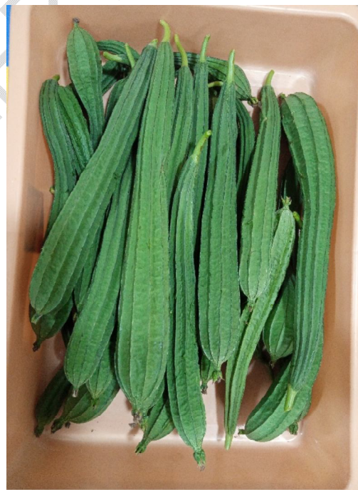
d) Harvested fruits