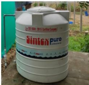
a) Overhead water tank

Concrete slabs (2 x 2 feet) were installed over a brick work adjacent to the 30 concrete poles fixed for the pandal construction (6 lines x 5 rows) with a 10-foot spacing on either side. The concrete slabs were firmly aligned at a constant height using the tube level. The tubs were put on concrete slabs. Each tub had a growing media container. Each container was filled with growth media based on the randomization of treatments (Fig.3).