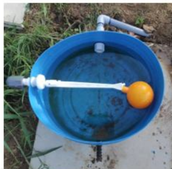
b) Steady water level tub