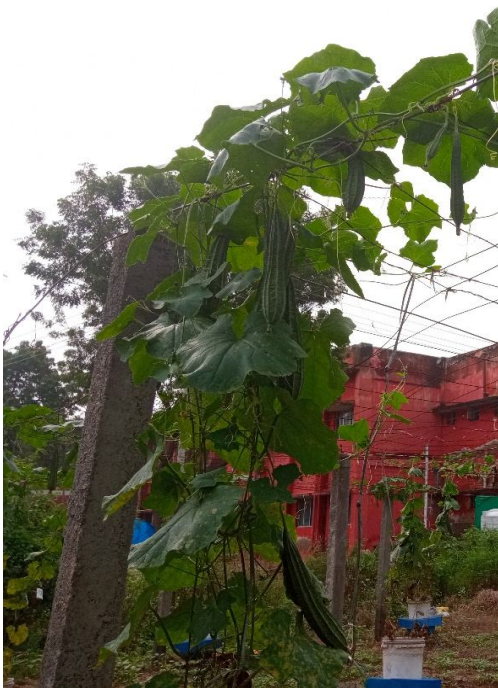
c) Fruiting in growing media with CP+VC+Sand