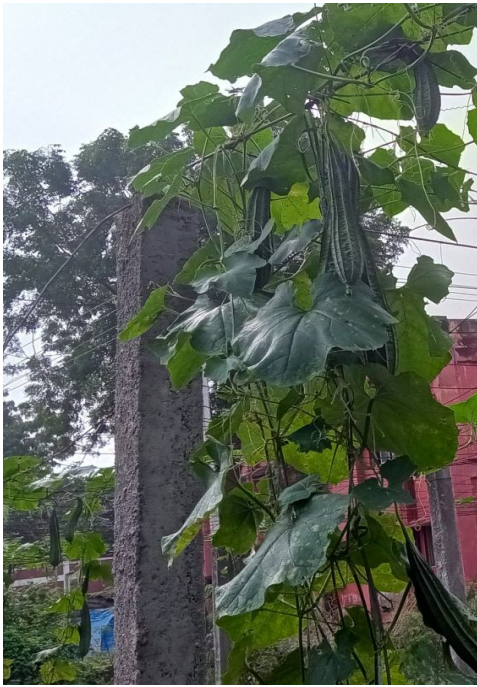
a) Fruiting in growing media with CP+VC+GM+Sand