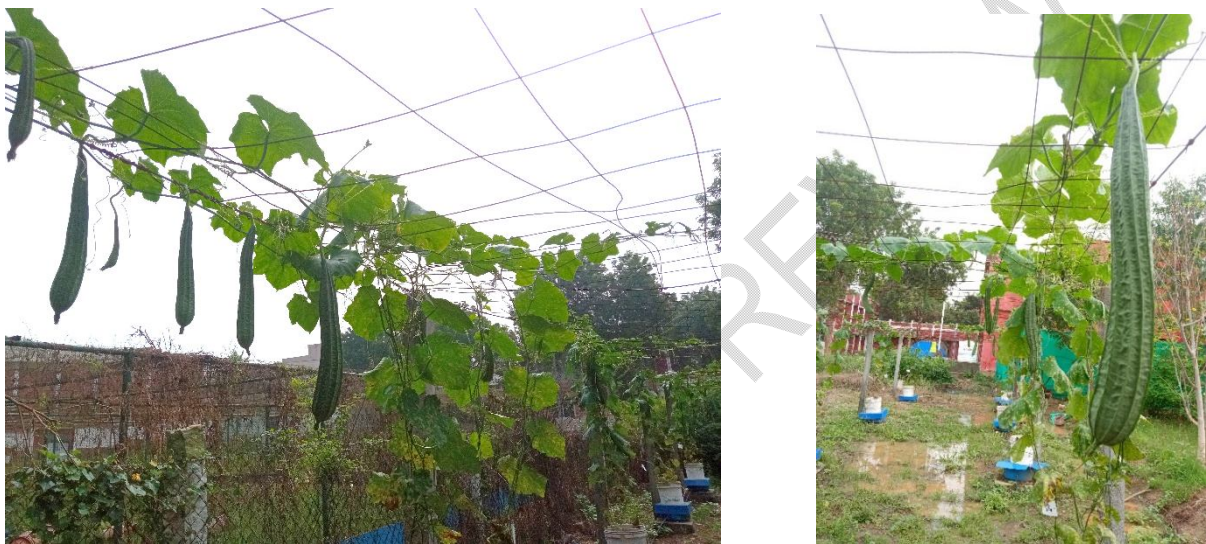
Fig.4. Experimental view of ribbed gourd at yielding stage

Daincha, the most popular green manure crop, thrives well in both saline and alkaline soils. Bhuiyan et al. [36] found that roughly eight weeks old dhaincha plants had 3% N in addition to other nutrients. The addition of Daincha as dry powder to vermicompost and coirpith resulted in a considerable boost in growth and yield parameters.