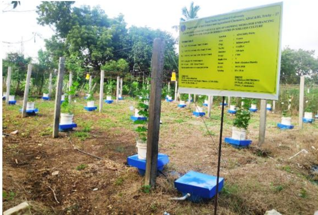
Fig.1. View of soilless media experiment in pandal structure

Concrete slabs (2 x 2 feet) were installed over a brick work adjacent to the 30 concrete poles fixed for the pandal construction (6 lines x 5 rows) with a 10-foot spacing on either side. The concrete slabs were firmly aligned at a constant height using the tube level. The tubs were put on concrete slabs. Each tub had a growing media container. Each container was filled with growth media based on the randomization of treatments (Fig.3).