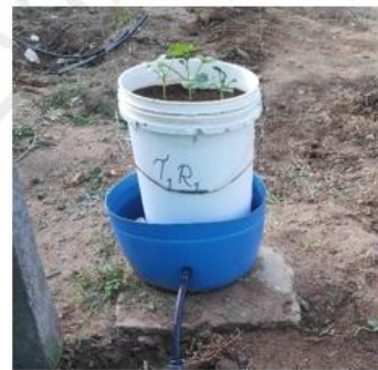
c) Container inside plastic tub