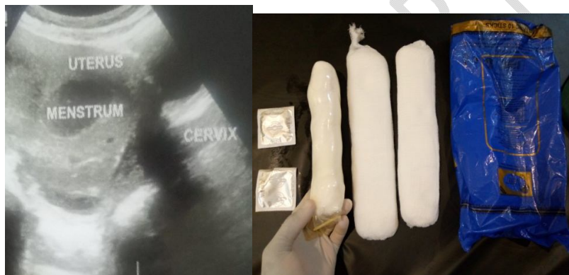
Fig. 1 & 2; Pre-operative pelvic scan showing haematometria , sanitary pads and condoms used to recreate penile mould respectively.

the index finger was used to bluntly dissect the vaginal tissues exposing raw areas superiorly and inferiorly until the cervix was visible in its entire circumference and the vagina could admit two fingers and a standard sized speculum. The cervical canal was successfully easily probed and entry into uterine cavity confirmed under pelvic scan. Haemostasis was maintained with a combination of pressure, 1:10,000 units adrenaline packing and a few interrupted polyglactin 2/0 sutures. Anti-adhesion barrier was placed over the raw vaginal areas superiorly and inferiorly. An improvised disposable penile mould was made using a lubricated condom containing an adult size maternity sanitary pad which patient was taught how to make one for personal use till comfortable for sexual activity with spouse. She was discharged on oral analgesics, antibiotics and seen weekly for next 3 weeks. She had good recovery and was later discharged from the clinic with good outcome.