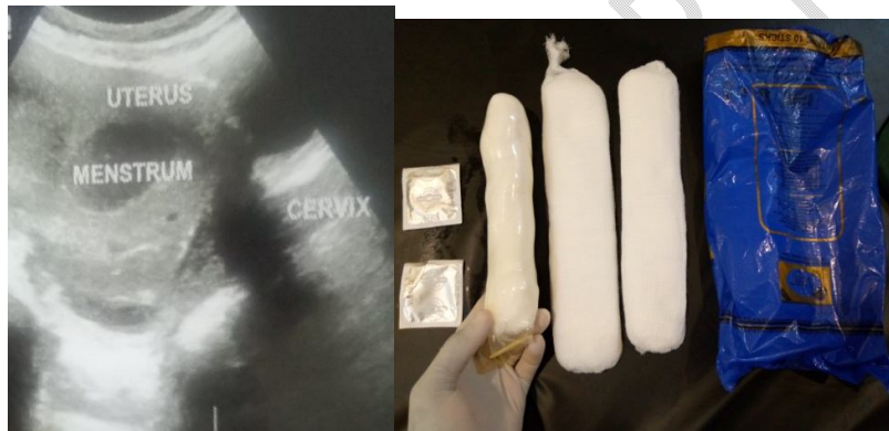
Fig. 1 & 2; Pre-operative pelvic scan showing haematometria , sanitary pads and condoms used to recreate penile mould respectively.

the index finger was used to bluntly dissect the vaginal tissues exposing raw areas superiorly and inferiorly until the cervix was visible in its entire circumference and the vagina could admit two fingers and a standard sized speculum. The cervical canal was successfully easily probed and entry into uterine cavity confirmed under pelvic scan. Haemostasis was maintained with a combination of pressure, 1:10,000 units adrenaline packing and a few interrupted polyglactin 2/0 sutures. Anti-adhesion barrier was placed over the raw vaginal areas superiorly and inferiorly. An improvised disposable penile mould was made using a lubricated condom containing an adult size maternity sanitary pad which patient was taught how to make one for personal use till comfortable for sexual activity with spouse. She was discharged on oral analgesics, antibiotics and seen weekly for next 3 weeks. She had good recovery and was later discharged from the clinic with good outcome.