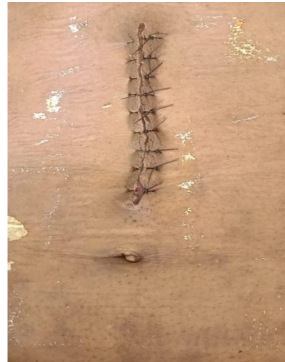
Fig 6 and 7: Surgically retrieved image of Chinese Kencheoda mobile phone; 4 cm upper midline laparotomy post skin closure wound.