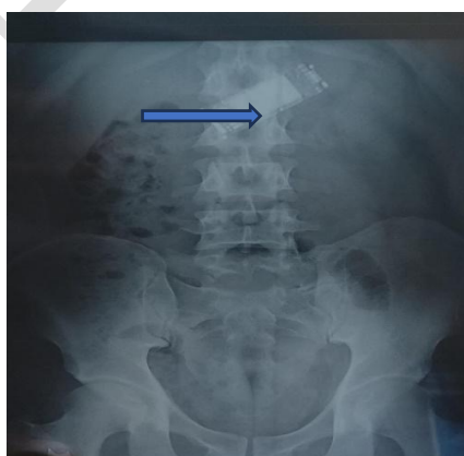
Fig 1: Erect XRay abdomen showing foreign body in stomach.

Investigations- Radiological investigations were done to confirm the foreign body. Serial radiographs confirmed the foreign body remained in situ in the stomach.