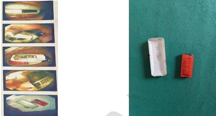
Fig 2 and 3: Endoscopic image of mobile phone; battery and back cover of endoscopically retrieved mobile phone

Management- A decision to remove the foreign body using upper gastrointestinal endoscopy under sedation was made. A semi-opened mobile phone was noted. After multiple failed attempts using snare and basket, battery and back cover was retrieved with difficulty using rat toothed forceps, followed by which multiple attempts to retrieve the body of the mobile was made but was unsuccessful. Size of the device, with its un mouldable nature posed difficulty to align the device during endoscopy. Patient was posted for surgery to remove the remaining device, as it would not pass through the pylorus.