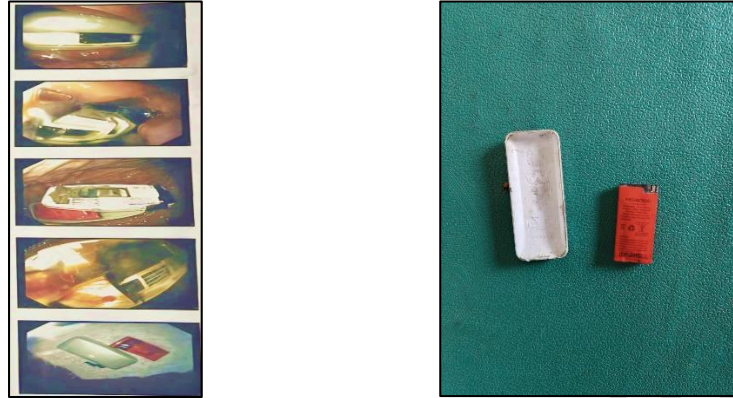
Fig 2 and 3: endoscopic image of mobile phone; battery and back cover of endoscopically retrieved mobile phone

present in antrum of stomach. A decision to remove the foreign body using upper gastrointestinal endoscopy under sedation was made. A semi-opened mobile phone was noted. After multiple failed attempts using snare and basket, battery and back cover was retrieved with difficulty using rat toothed forceps, followed by which multiple attempts to retrieve the body of the mobile was made but was unsuccessful.