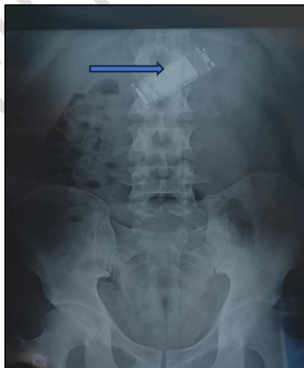
Fig 1: Erect XRay abdomen showing foreign body in stomach.

A 25-year-old prisoner with a history of nine days old intentional ingestion of mobile phone which he smuggled in jail presented to the emergency department with complaints of pain abdomen. Patient was initially taken to nearby district hospital from where he was referred to our hospital for further management. History and clinical examination were unremarkable. Radiological investigations were done to confirm the foreign body. Serial radiographs confirmed the foreign body remained in situ in the stomach.