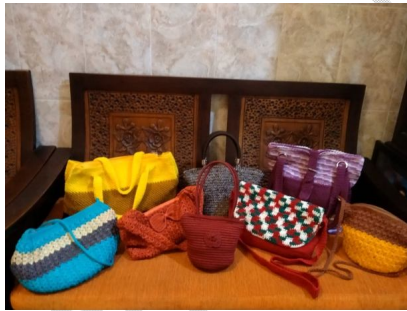
Fig. 2. Audy Handmade Product Sample

One of the MSMEs that operates in the handicraft sector is Audy Handmade. This MSME focuses on self-produced knitted bags which can be seen in Fig. 2. They operate the business by involving 1-2 employees who came from a housewife in the village. These MSMEs also play a role in the village economy because they also contribute to labor absorption. Certainly, every MSME aims to maximize the sale transaction number. This is not without reason because the goal of sales is to obtain a certain level of profit and support business growth [5]. However, the main problem for the majority of MSMEs including Audy Handmade is how to develop a marketing strategy [6]. Determining an inappropriate marketing strategy can lead to not optimum sales transaction number.