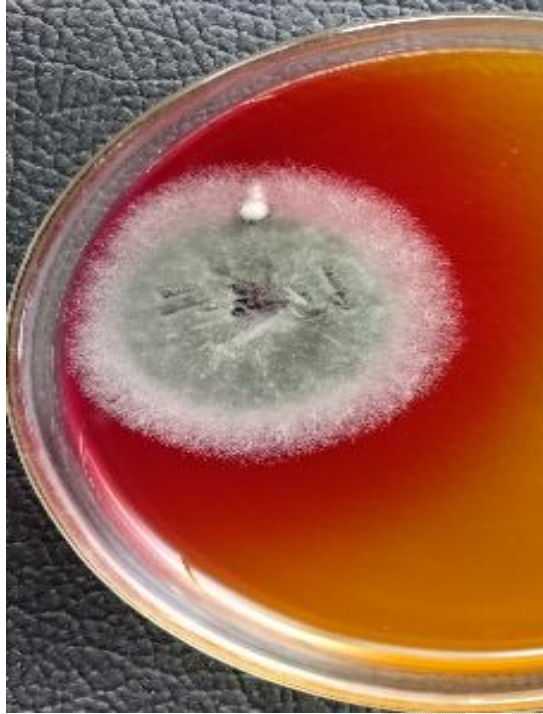
Plate 1. The hair sample inoculated on D.T.M showed growth of dermatophyte, characterized by white aerial hyphae and a red coloration around the fungal growth

The positive fungal cultures were identified by the conidial structure produced and the presence of septate hyphae (Fig. 4).