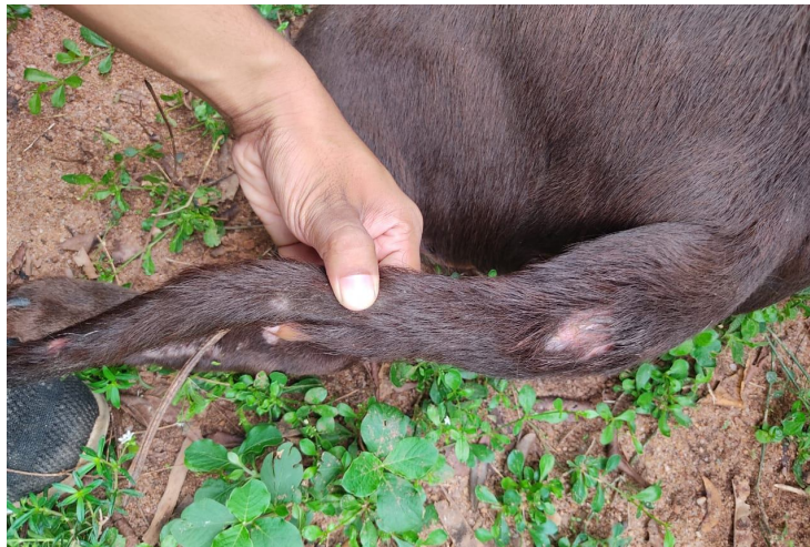
Fig 1. Patchy ringworm lesion on the tail of a female dog