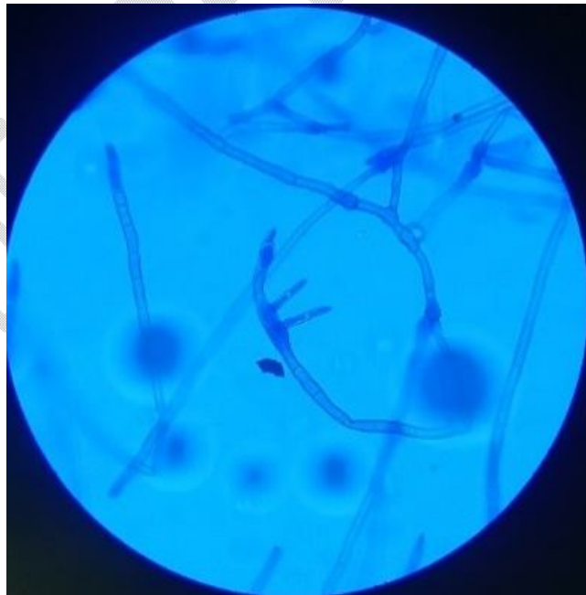
Fig4. Macroconidia with septate hyphae of Microsporum canis after staining with Lactophenol Cotton blue stain 40X

The positive fungal cultures were identified by the conidial structure produced and the presence of septate hyphae (Fig. 4).