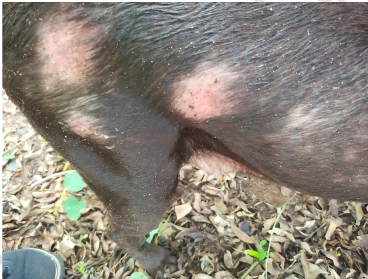
Fig 2. Patchy hair loss on the hind leg of a female dog