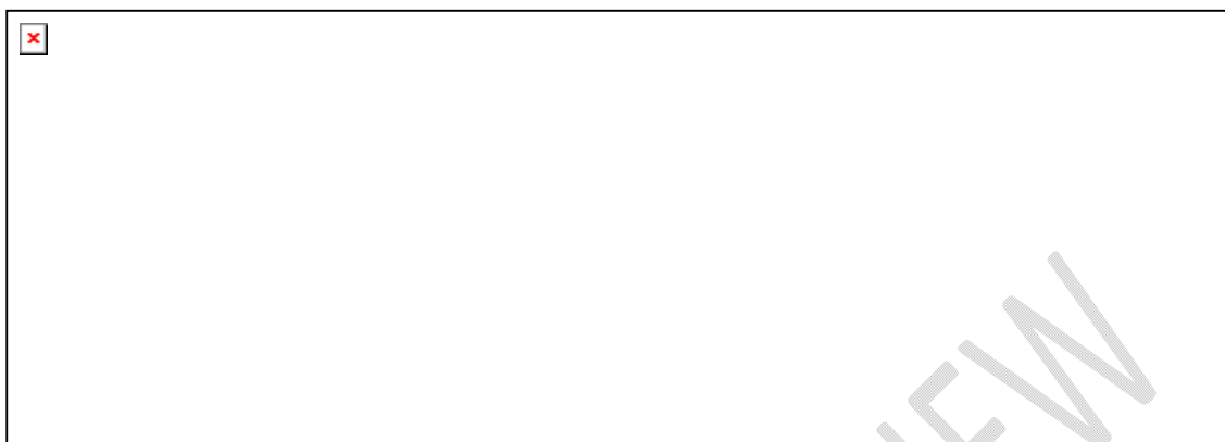
Fig. 1. Proline ( \mu\text{mol g}^{-1} ), protein ( \mu\text{g g}^{-1} ) content and NDVI of cowpea at stress as influenced by varied durations (a) and time/stages (b) of waterlogging.

This is in line with the recent findings of Basavaraj et al. [6] who indicated that waterlogging stressed cowpea plants recorded lower NDVI values (0.38) compared to non-waterlogged plants (0.71).