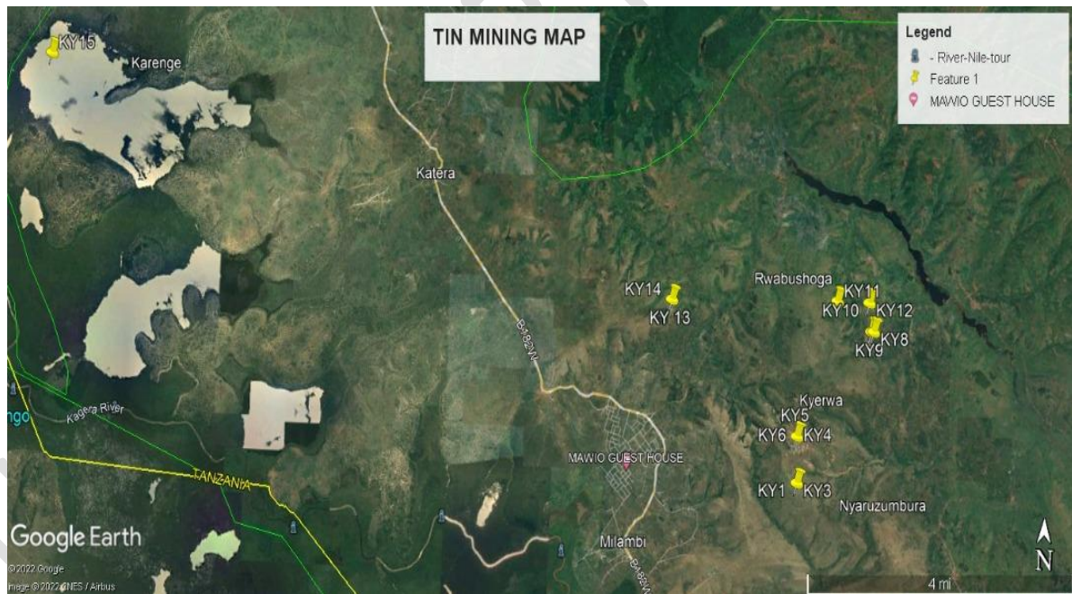
Figure 1. Map of the Study Area in Kyerwa Mining

The sampling area from the mine was divided into three zones: the northern (Kabingo, Kabagambe mine), the central (Kabushoke mine), and the southern (Chabitembe mine). Sampling locations are depicted in Figure 1. Six samples of soil were collected randomly from each sampling zone to make a total of 18 samples of soil. The samples were taken at a depth of 0 to 5 cm, as previously described by Ajayi [4, 10]. The collected samples were then sent to the TAEC laboratory for processing and analysis in labeled polythene bags.