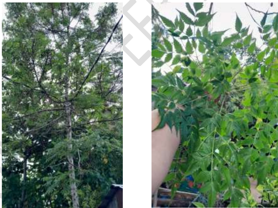
Figure 2. Image of Melia azedarach (Chinaberry)

Young leaves of Melia azedarach (Chinaberry) were collected at Barangay Rawis, Laoang, Northern Samar. The collected plant sample leaves were placed in a plastic bag and was transported to the Chemistry Laboratory at University of Eastern Philippines, University Town, Northern Samar where the test was conducted.