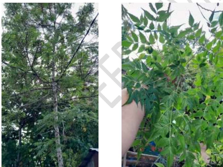
Figure 2. Image of Melia azedarach (Chinaberry)

Young leaves of Melia azedarach (Chinaberry) were collected at Barangay Rawis, Laoang, Northern Samar. The collected plant sample leaves were placed in a plastic bag and was transported to the Chemistry Laboratory at University of Eastern Philippines, University Town, Northern Samar where the test was conducted.