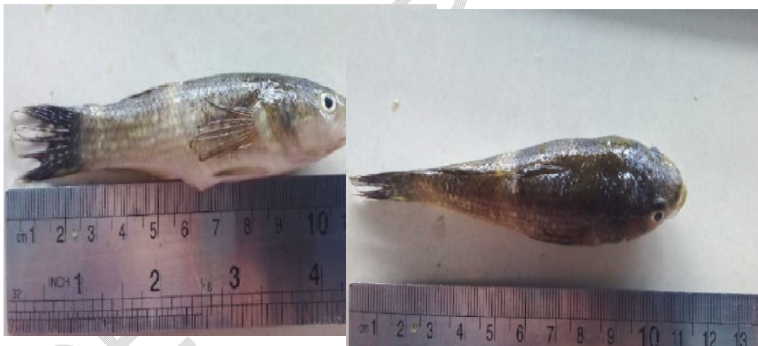
Fig 2. Specimen of O. porocephala caught on October 2021