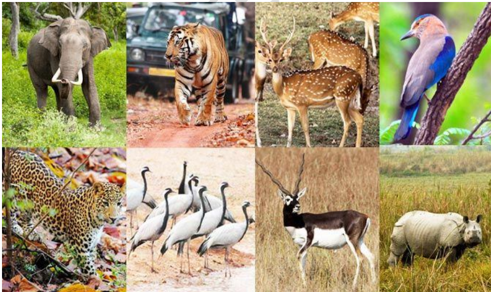
Image: 2- Impact on Wildlife of Colonial Forest Law in India

Sources: Field Survey during Research work in different Wildlife Reserves