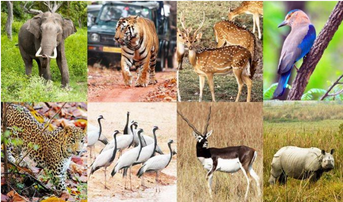
Image: 2- Impact on Wildlife of Colonial Forest Law in India

Sources: Field Survey during Research work in different Wildlife Reserves